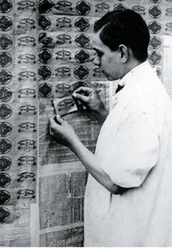
▲ In 1923, a German man papers his walls with money made nearly worthless by high inflation following World War I.

countries signed the Kellogg-Briand Pact, which renounced war as a national policy. However, the pact was futile, as it provided no means of enforcement.