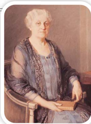
Carrie Chapman Catt

Catt called an emergency suffrage convention in September 1916, and invited President Wilson, who cautiously supported suffrage. He told the convention, "There has been a force behind you that will . . . be triumphant and for which you can afford. . . . to wait." They did have to wait, but within four years, the passage of the suffrage amendment became the capstone of the progressive movement.